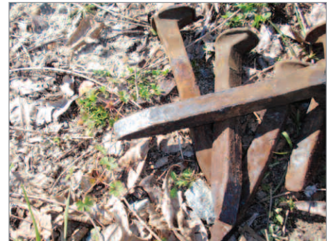
Clean, shiny spikes after 23 years of service illustrate boron corrosion-inhibiting properties.