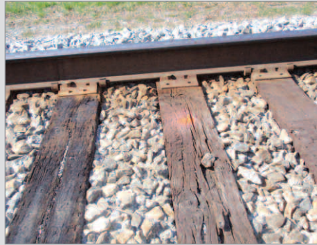
An example of a creosote-only white oak tie failing after nine years of service.