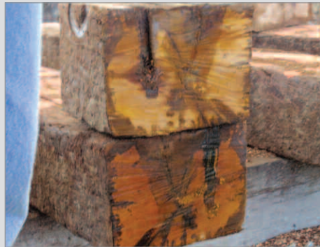
These two Cordele ties are from the 2010 field trip and illustrate that borates remain present at efficacious levels throughout the center of the tie.