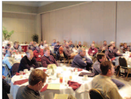
50 RTA members gather for lunch and hear presentations from NS and TaskPro on the day’s events.