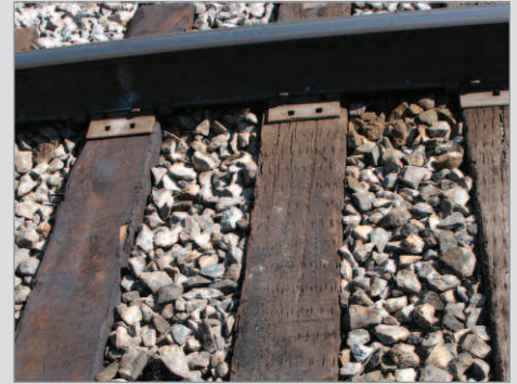
In comparison, this center tie is a dual-treated test tie that remains in near perfect condition after 23 years of service.

technology. It became clear that because the borates remained mobile and would diffuse to the highest moisture locales inside a tie, protection was being delivered just where it was needed most. Decay fungi could never get a foothold in a tie and, thus, 15 years after the test's inception, the dual-treated ties were performing as if new.