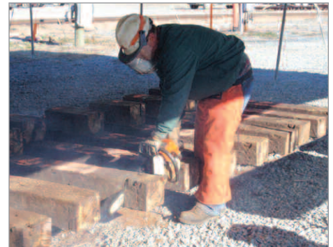
Ties being sectioned by NS personnel.