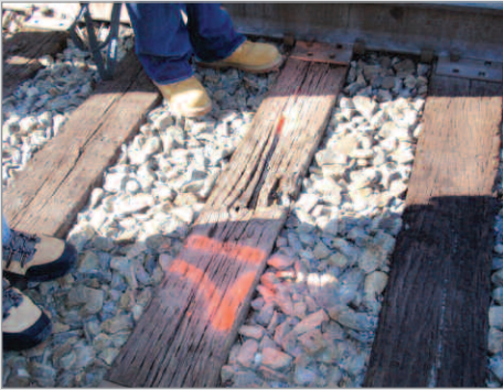
Premature failure, such as the middle tie shown here, is what borate pre-treatments prevent.