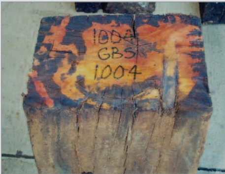
As a reference point, this borate pre-treated tie from the 1987 test in Cordele was removed from track in 2002, sectioned and reagent applied to show borate retention.